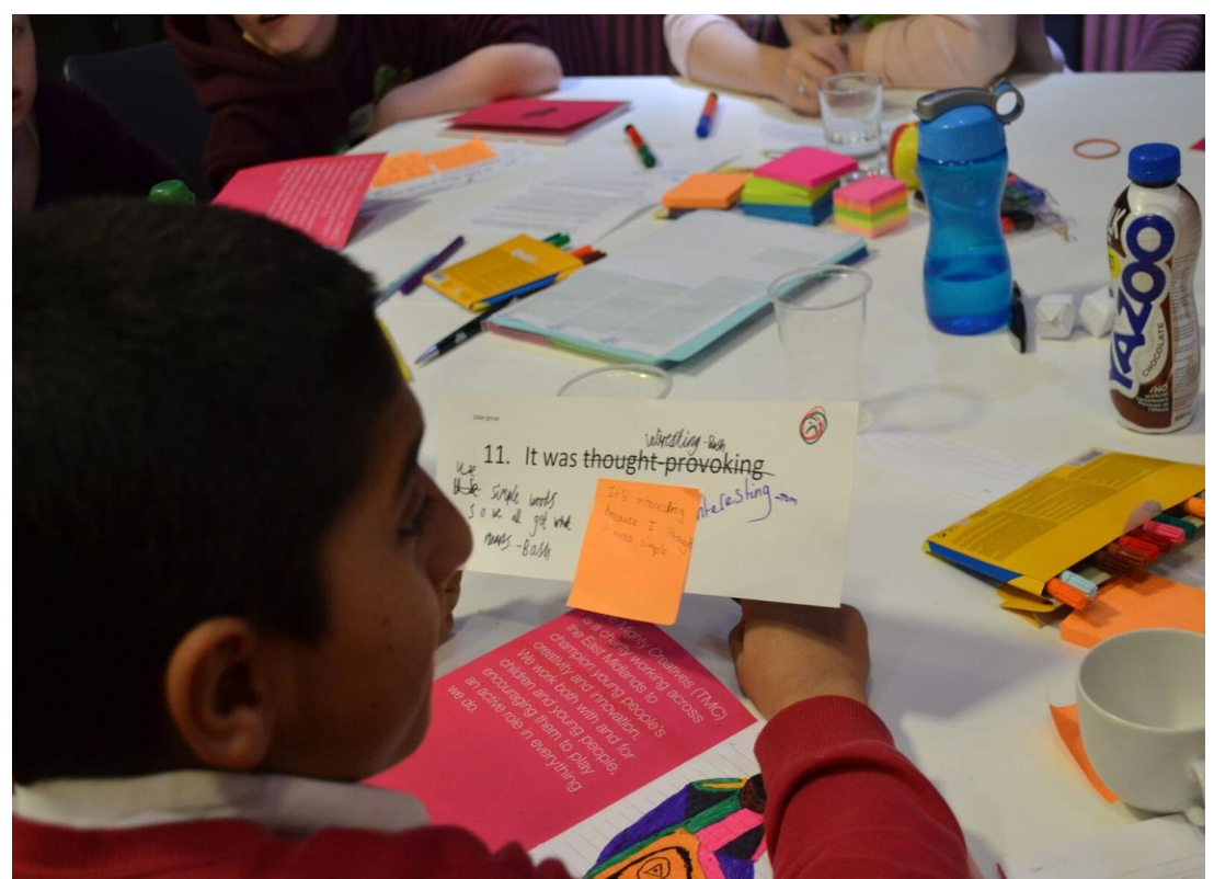
Participants refining the metrics at the engagement day for children and young people at Derby QUAD

3.10 The first session was designed to gauge the young peoples' reaction to and understanding of the metrics. Young people were asked to think about the recent arts experiences they had been to. The peer researchers went through the metrics one by one, and asked the groups to say whether they agreed or disagreed with the statements. The young people were invited to provide brief explanations for their responses. This activity enabled the researchers to make preliminary judgements on whether the groups understood the metrics, basing this on observations of their reactions to the statements and their explanations of why they agreed and disagreed. Researchers made a note of which metrics were clearly well understood, and those which would bear more detailed interrogation.