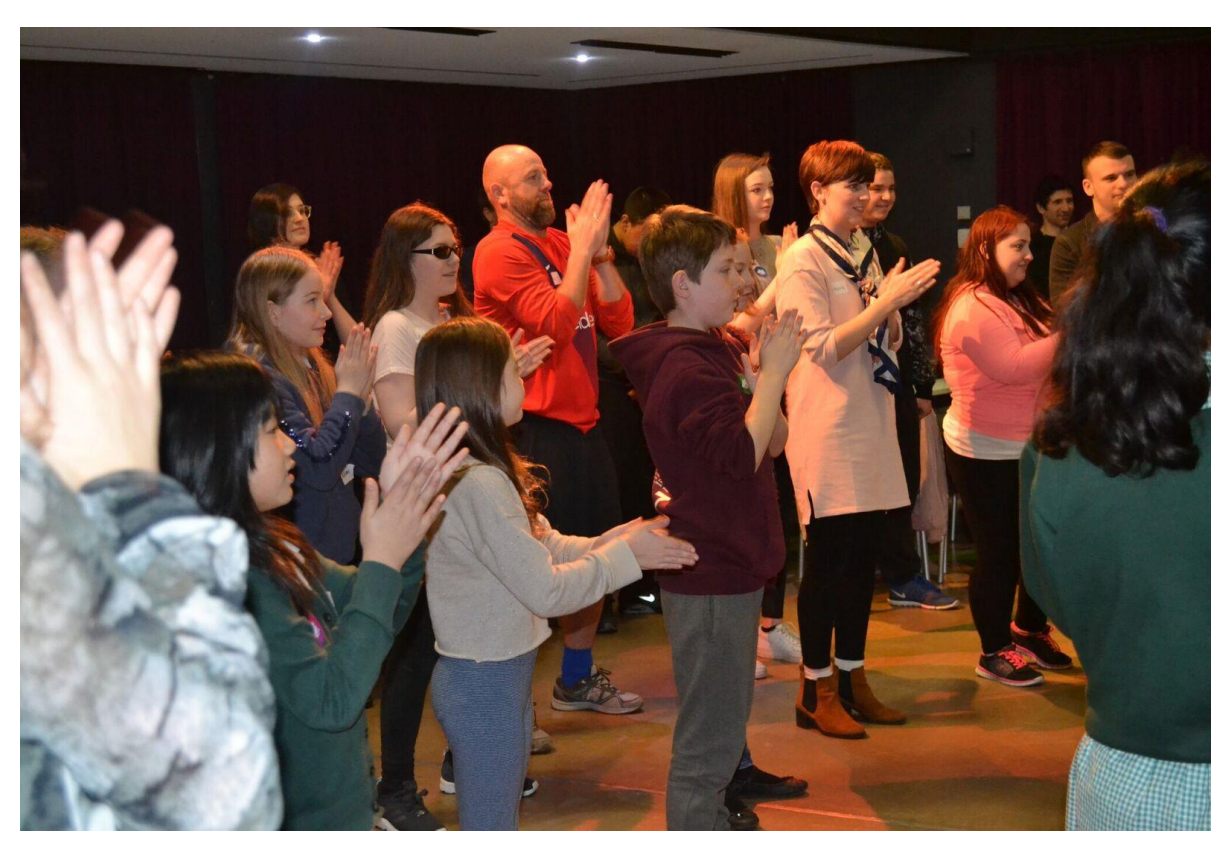
Warm up exercise at the engagement day for children and young people at Derby QUAD