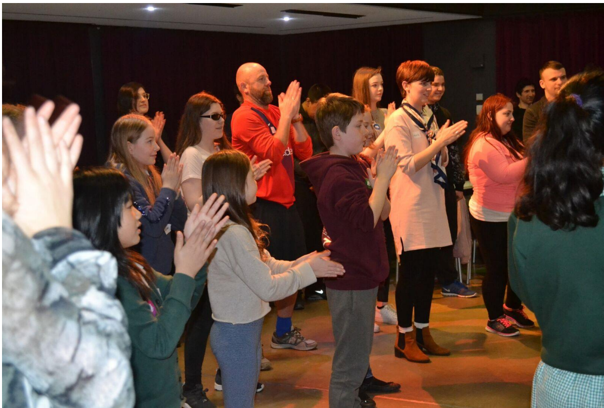
Warm up exercise at the engagement day for children and young people at Derby QUAD

3.2 Among the secondary and college age group, there was a mixture of young people who were in mainstream education, those who were in mainstream education but with a statement of special educational needs, and those who were educated outside of mainstream education working with Baby People, a specialist music and arts development organisation.