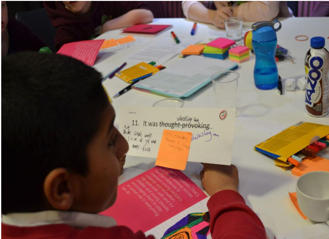
Participants refining the metrics at the engagement day for children and young people at Derby QUAD